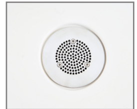
Step 5: Install new screen