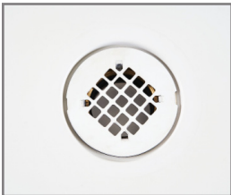
Step 1: Existing shower drain