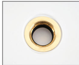
Step 2: Remove Screen