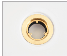
Step 4: Install new clamping nut