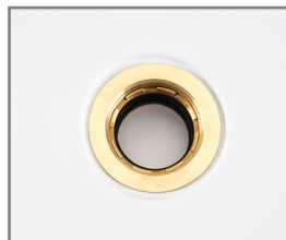
Step 2: Remove Screen