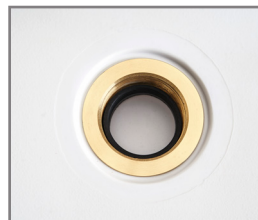
Step 3: Remove Clamping Nut