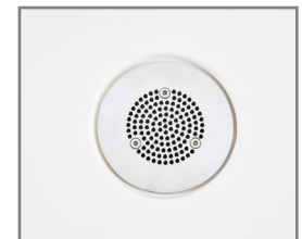
Step 5: Install new screen