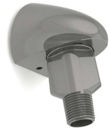
Shower Head with Hose Attachment